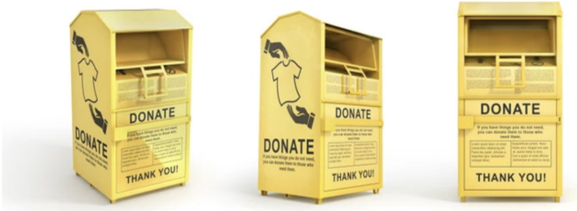
Example donation bins. 6